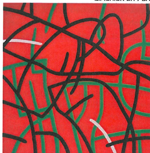
Samuel Walsh, Locus XVII (Wotan), 2015,